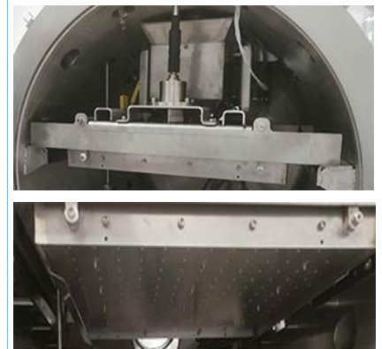
Figure 3: Design of Lunar Dust Filtering System. A special cellular dust cleaning system (Top). Dust sprinkling mechanism (Bottom).

The dust source consists of two units: a dust preparation unit and the dust sprinkling mechanism. The main advantage of this design is that no separate chamber for preparing the dust is needed (see Figure 3). This is achieved by using a special cellular dust “cleaning” unit being part of the dust source.