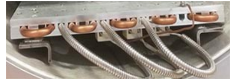
Figure 5: Heating and cooling plate

The Heating/Cooling Platform is an ultra-high vacuum set-up installed inside the simulator chamber and designated for sample holding and fast sample exchange. Differences in technical specifications of the platforms can be seen from Table 3.