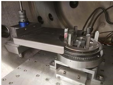
Figure 4: Rotating head of tribometer with a plate for heating and cooling the sample

SimulTek is able to offer a unique, vacuum- and dust-compatible tribometer, which allows the abrasive and wear testing per ASTM G65 in a standardized wear test when abrasive lunar or Martian dust simulant is loaded from the dust source and introduced between the specimen and a rotating rubber wheel. Under these conditions, the specimen is subject to constant wear, as the abrasive is pulled between the rubber surface and the surface of the specimen. The specimen is held in contact with the rubber wheel under a constant load, and the sand flows at a constant rate (see Figure 4).