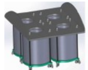
Figure 2: Lunar Dust Filtering System

The filtering system of the pumped-out air from dust is an extremely important component of any simulator of the lunar environment. The filters should not severely reduce the pumping speed and be able to work for a long time without replacement. Filters should be easily removable and have a reliable dust-proof seal.